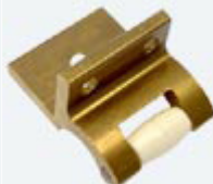
Keeper, Brass Lever LB4103