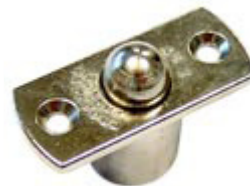
Latch D25 Brass-plated