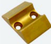
Keeper, Brass Stop LB4102