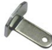
Right-angle 2 hole