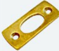
Keeper, Brass-plated Rabbit LB4101